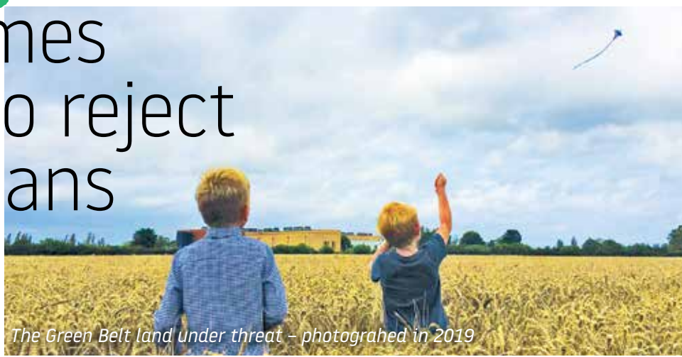
The Green Belt land under threat – photographed in 2019

One resident also highlighted the disruption to students at Kings Langley School, which directly adjoins the site, saying 'This work is slated to take three years. That's three years of diggers, drills, machinery, excavation and lorries every single day, just metres from a secondary school. I can't begin to imagine how seriously that will impact concentration, sports sessions and exam periods, not to mention the horrendous pollution that's going to be pumped into the school grounds. Either this hasn't been considered,